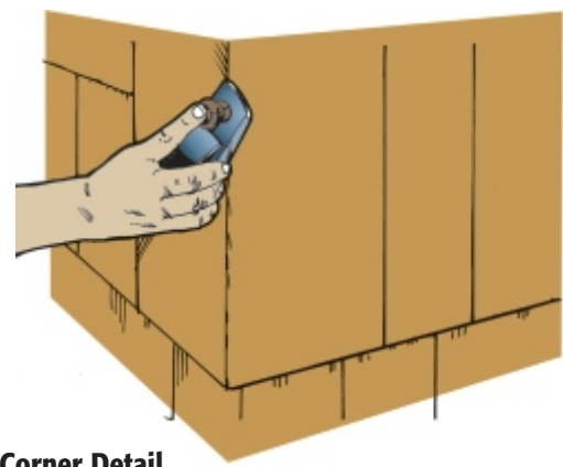
Figure 18: Corner Detail

The interior Certi-label Western Cedar shingles or shakes can now be finished to suit almost any taste. Contact a reputable finish manufacturer for more details.