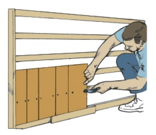
Figure 17: Starter Course