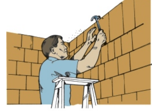
Figure 19: Top Course

The interior Certi-label Western Cedar shingles or shakes can now be finished to suit almost any taste. Contact a reputable finish manufacturer for more details.